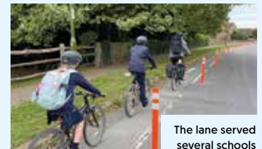
The lane served several schools

At the time of writing, our judicial review of West Sussex County Council's decision to remove a popular cycle lane in Shoreham had not been heard in the Crown Court. (It's due 25-26 Jan.) Thanks to everyone who has helped fund our case. If successful, it will make other councils think twice before ripping up cycling facilities. To find out more and donate, visit cyclinguk.org/cdf