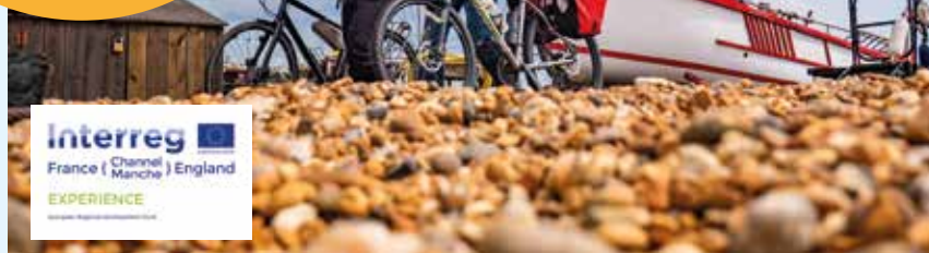
Left: Robert Spinning

12 cycle routes to tackle in 2022. Read our suggestions: cyclinguk.org/article/12-cycle-routes-do-2022