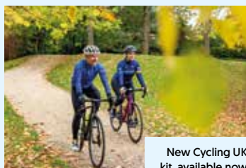
New Cycling UK kit, available now

New bike this Christmas? Protect it with £50 off Yellow Jersey bike insurance and get 15% off security marking kits with Bike Register to help combat bike theft. For a wardrobe update, check out the Stolen Goat X Cycling UK kit. Each item purchased helps fund our campaigning and charitable projects. Visit: stolengoat.com/cycling-uk . For details of all member discounts, see: cyclinguk.org/member-benefits