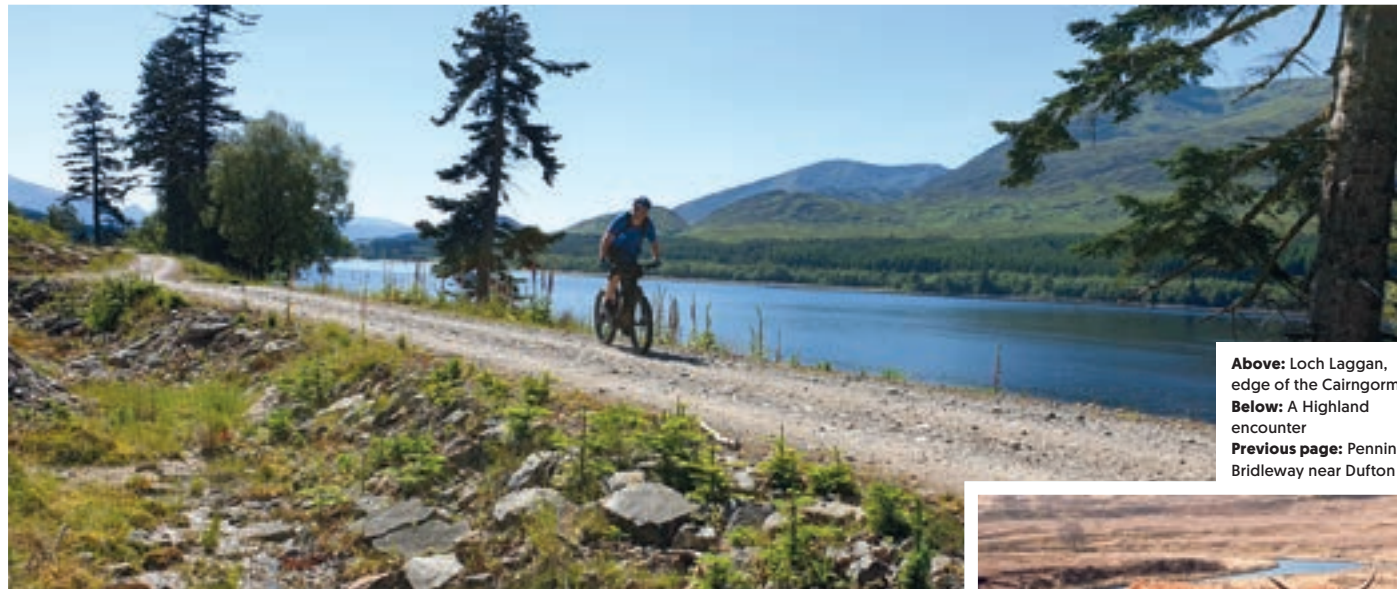
edge of the Cairngorms Previous page: Pennine

eep in the Scottish Highlands, in a remote glen with far-reaching views in all directions and not a soul in sight. I stop pedalling and roll to a stop. I look down the long