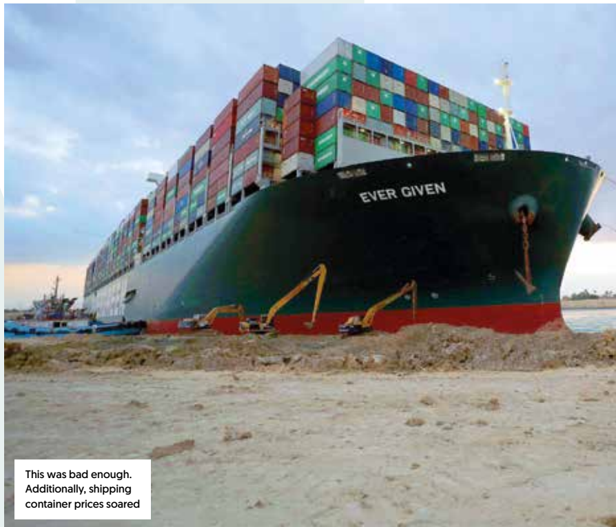
This was bad enough. Additionally, shipping container prices soared