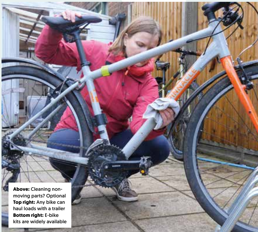
Above: Cleaning non-moving parts? Optional Top right: Any bike can haul loads with a trailer Bottom right: E-bike kits are widely available