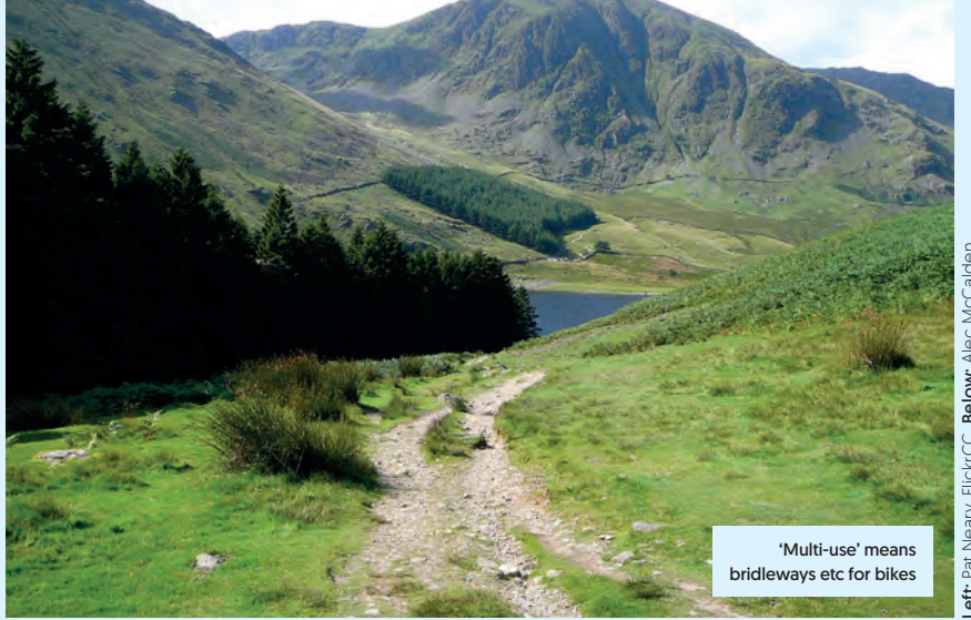
'Multi-use' means bridleways etc for bikes