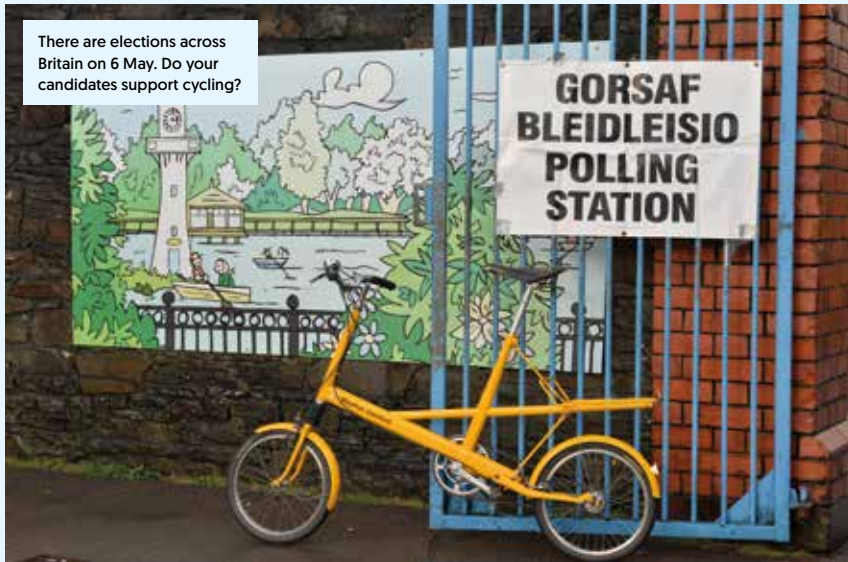
There are elections across Britain on 6 May. Do your candidates support cycling?