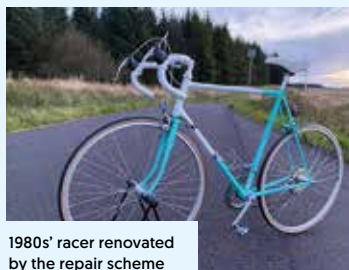
1980s' racer renovated by the repair scheme

The Scotland Cycle Repair Scheme is getting people onto bikes across Scotland – 20,000 and counting so far! The scheme provides help to those who need it most, with £50 of free cycle repairs and servicing at 330 Scottish bike shops. Cycling UK is administering the scheme, which runs until the end of May, on behalf of the Scottish government. For more information, visit cyclinguk.org/ScotCycleRepair .