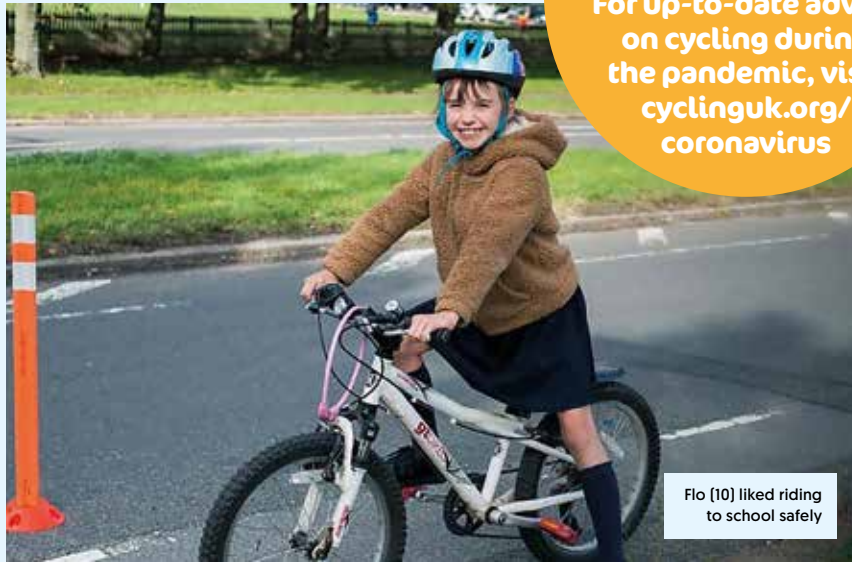
Flo (10) liked riding to school safely

Covid-19 For up-to-date advice on cycling during the pandemic, visit cyclinguk.org/ coronavirus