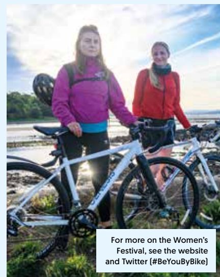
For more on the Women's Festival, see the website and Twitter (#BeYouByBike)

Cycling UK is celebrating the fifth Women's Festival of Cycling from 17 July to 1 August, and this is your opportunity to help and empower more women to cycle. Far fewer women in the UK ride a bike than men, but with encouragement from their friends and families we know we can redress the balance. We'll be asking you to pitch in this July by taking a female friend out riding, sharing your cycling inspiration online, and taking part in our festival activities. cyclinguk.org/womensfestival