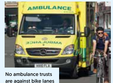
No ambulance trusts are against bike lanes

Some parts of the British media would have you believe that the pandemic's pop-up bike lanes delayed ambulances. Cycling UK's freedom of information request revealed that none of the ambulance trusts in England, Scotland and Wales are against the new lanes, while a third of them strongly support the lanes because of their public health and road safety benefits. cyclinguk.org/ambulance-foi-2021