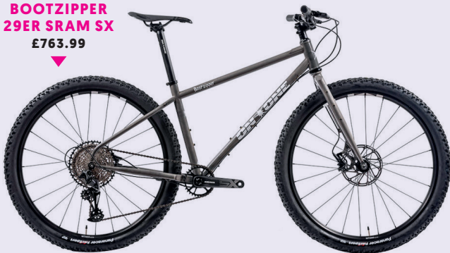
ON ONE BOOTZIPPER 29ER SRAM SX £763.99

If you want something faster and feistier, then the On-One Whippet (currently £999.99 ) has a full carbon frame and fork. It's a lot lighter and has a sportier ride in general. Broad WTB rims and a wide riser bar still give it a surefooted, power-assisted steering feel if you end up going quicker than you expected in the woods. It too comes with SRAM SX Eagle 12-speed, but there are fewer fixtures for bags, mudguards, etc.