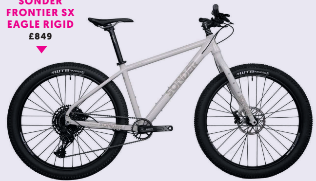
SONDER FRONTIER SX EAGLE RIGID £849

The combination of a rigid fork and a flat or riser bar can be hard on the hands, even with 29er tyres. If it's a problem, try comfy grips (e.g. ESI Chunky Grips, £16 ) in combination with Cane Creek Ergo Control bar ends (£29.99) . A back-swept loop handlebar like the On-One Geoff (£29.99) also works well, but you'll need to fit longer brake hoses and a longer gear cable. ●