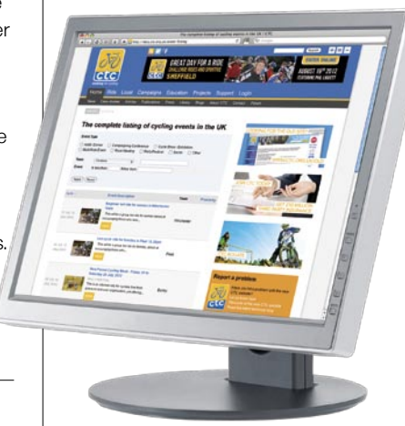
You can request information in print, but by default CTC information to members is going digital

Visit ctc.org.uk and click the Events tab, which is in the Ride menu, and you will find a searchable database of hundreds of rides of all kinds. Look for rides by type, area or distance – or narrow down your search in other ways.