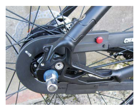
Above: A Hebie Chainglider helps keep water and dirt off the chain – and oil off your trousers

Both sport a welded aluminium frame with fork of the same ilk and run Shimano hydraulic disc brakes. Ignore the BMC's low-set seat stays and down tube profile, and they could have issued from the same CAD program, right down to the high bottom bracket. The BMC even has a split right-hand seat stay to accept