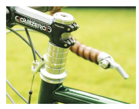
Short head tube requires a stack of spacers to achieve a comfortable touring position, especially for taller riders

Frame strength and geometry combine to provide a stable, flex-free, shimmy-free