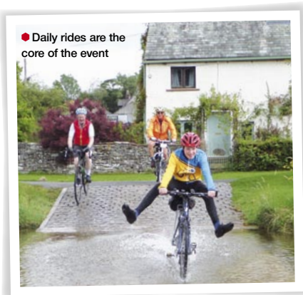
● Daily rides are the core of the event

For more on the Birthday Rides, visit birthdayrides.org