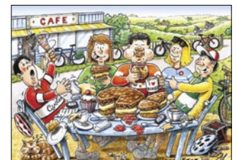
Illustration: Alan Rowe