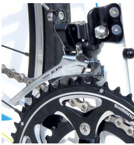
(Above) This mech goes no lower, so you can't retro-fit smaller chainrings

(Below) Extra levers add from-the-tops braking