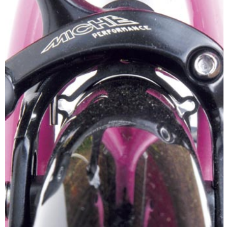
(Above) Good clearance under the brake calliper is wasted by thick mudguard fittings (Below) The inner chainring hangs off the middle – and cannot be smaller than 30