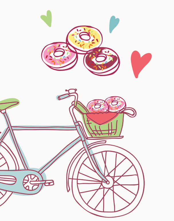
plenty of fun & cakes stopsl

The 'original Belles' in Glasgow helped CTC put this guide together for anyone wanting to set up a cycling group for women - although it might help some chaps out there too. Check out the Glasgow Belles Meet Up page http://www.meetup.com/Belles-on-Bikes-Glasgow/