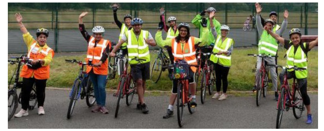
Cycling UK volunteers in Birmingham.